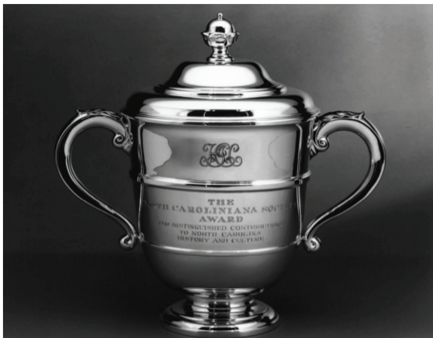
ABOVE: The original cup is in the North Carolina Collection at UNC-Chapel Hill's Wilson Library.