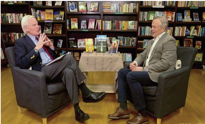
ABOVE: John Grisham discusses The Guardians on a Bookwatch program recorded at Flyleaf Books in Chapel Hill.